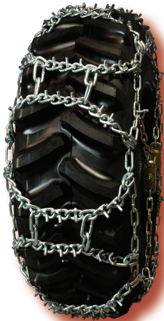
V-Bar: angled view with adjuster

You will not require any tools, the sections are joined using Quick Links. Please see reverse side.