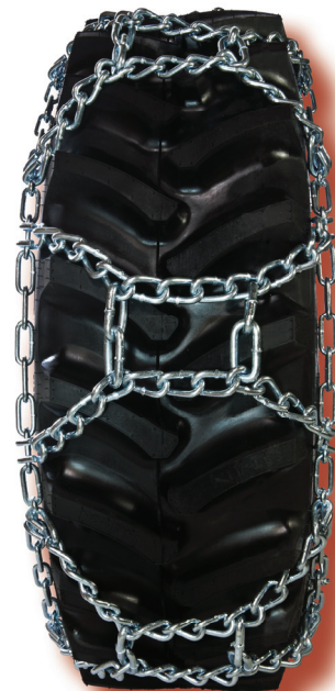
Regular Link: front view